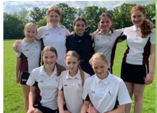
Year 8 Rounders