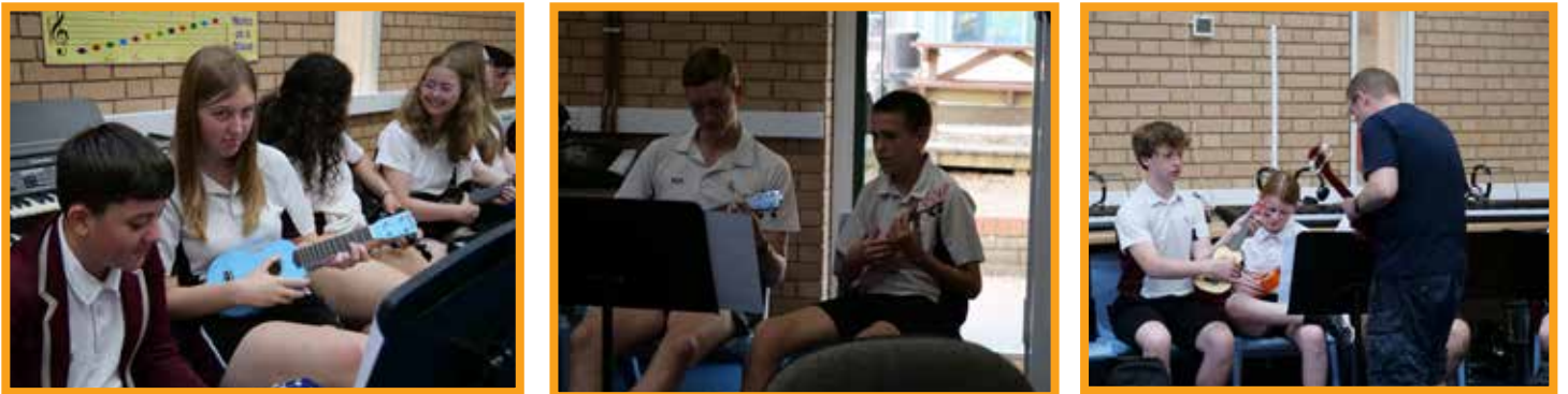
In Music students learnt how to play new instruments.