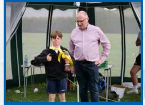
The House Cup for Year 7 was won by MCN (WAYTEMORE)