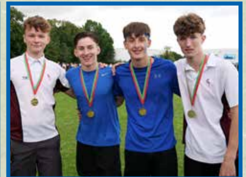
Year 10 Relay - Gold Medallists