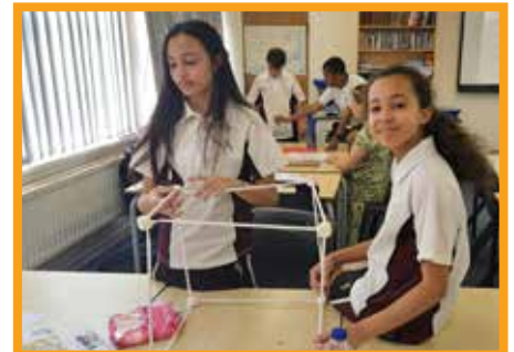
Students made earthquake proof buildings in Humanities out of spaghetti and marshmallows, replicating those found in earthquake zones..