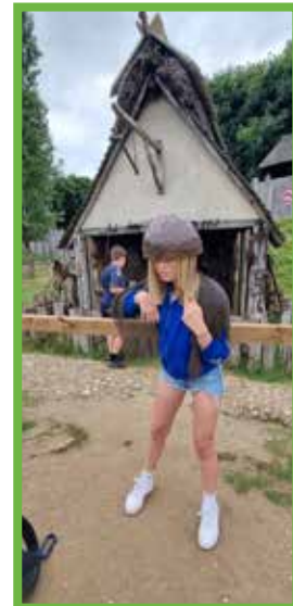
Year 7 visited Stansted Mountfitchet Castle.