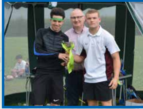
The House Cup for Year 10 was won by MAS (DANE)