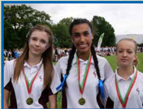
Year 10 Relay - Gold Medallists