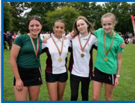
Year 8 Relay - Gold Medallists