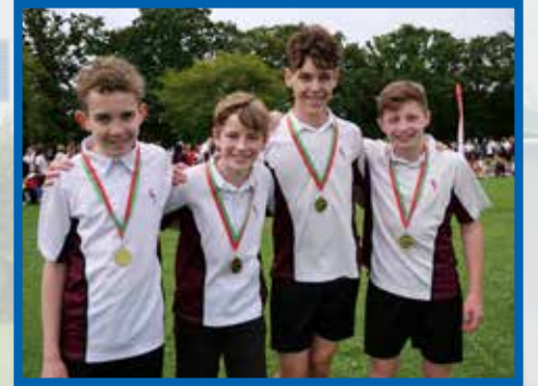
Year 8 Relay - Gold Medallists