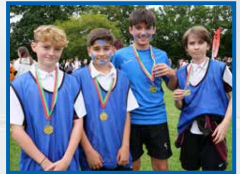
Year 7 Relay - Gold Medallists