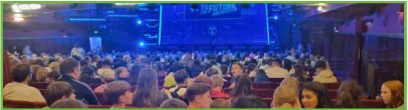
Theatre trips included Year 8 at Back to the Future and Wicked for Year 9.