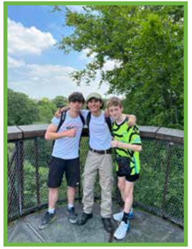
Year 9 visited Kew Gardens.