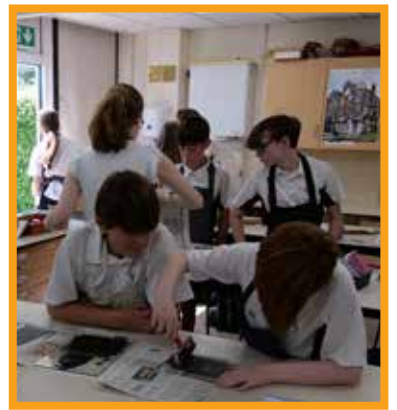
In Art, students learnt lino cutting and print making.