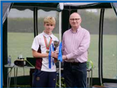
The House Cup for Year 9 was won by CHT (STORT)