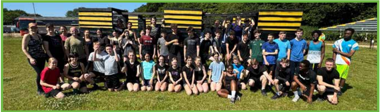
Year 10 students went to the Nuclear Wild Forest Assault Course.