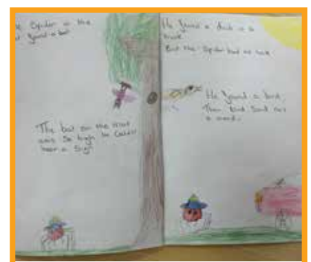
Students in Year 9 and Year 10 were tasked with planning, writing, illustrating and pitching a new children's book for children aged 3-7 (in 2.5 hours) during English. They began by thinking back to their own childhoods and sharing their favourite stories before exploring some classics for inspiration: Dear Zoo by Rod Campbell, The Very Hungry Caterpillar by Eric Carle, Guess How Much I Love You by Sam McBratney and The Gruffalo by Julia Donaldson.