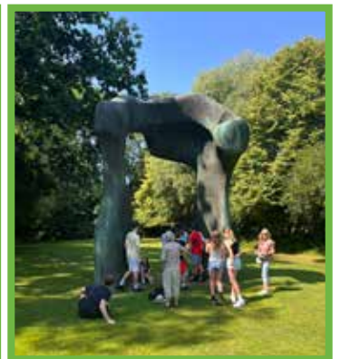
Year 8 went to the Henry Moore Studio and Gardens.