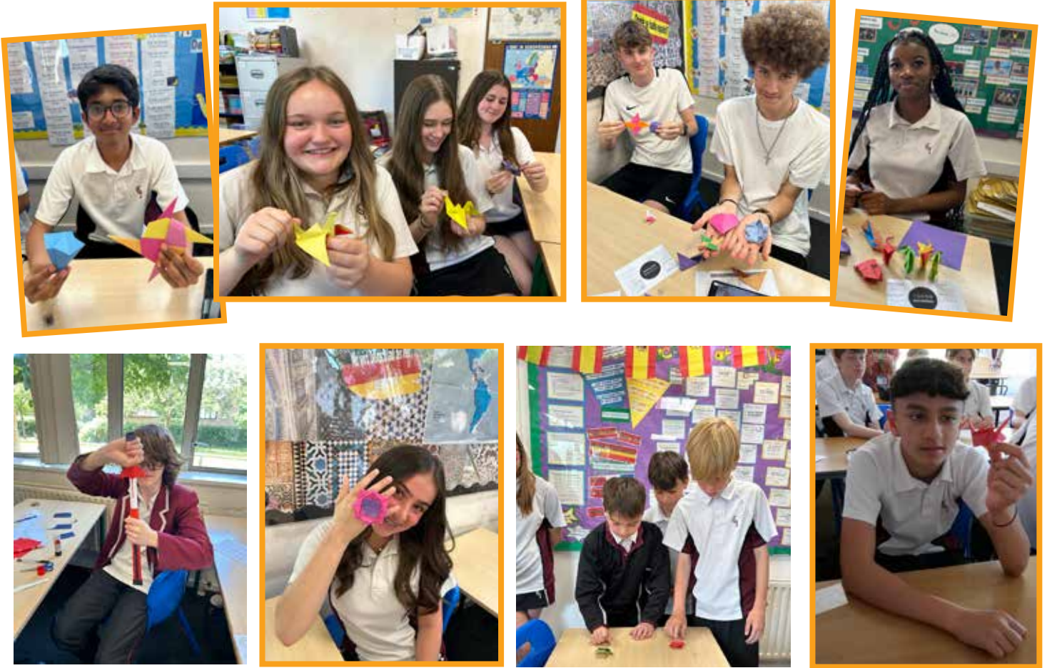
In Modern Foreign Languages, students learnt about the Japanese language and culture. They had fun making origami and having origami frog races!