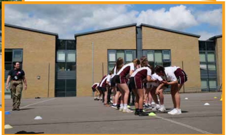
Army - team building within year groups.