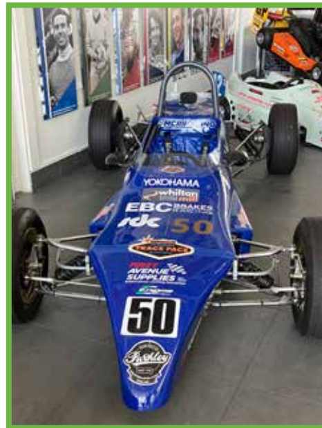
Year 10 visited Silverstone.