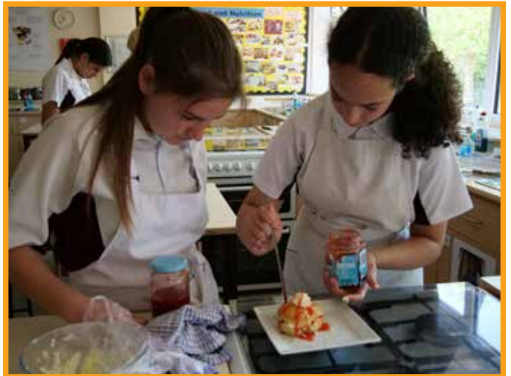
Food Technology offered classes in how to make a cream tea. Yum!