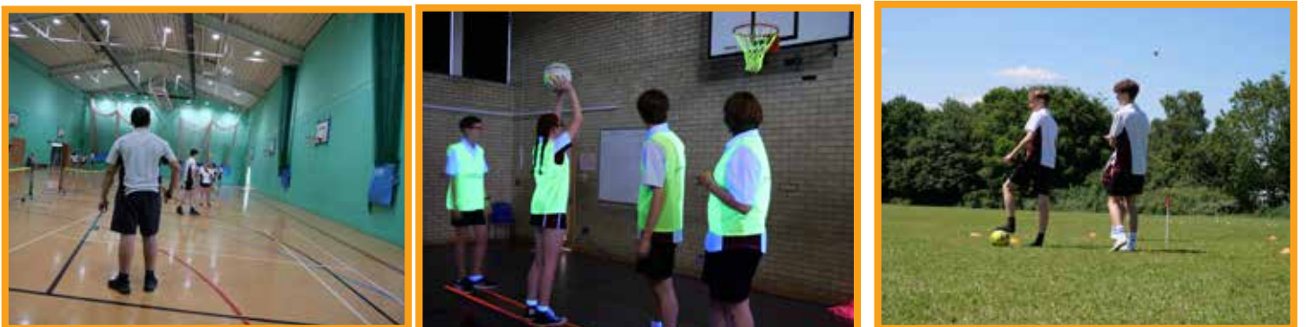
The PE Department offered students the opportunity to try new sports including UV dodge-ball, bench ball, pickle ball and foot-golf.