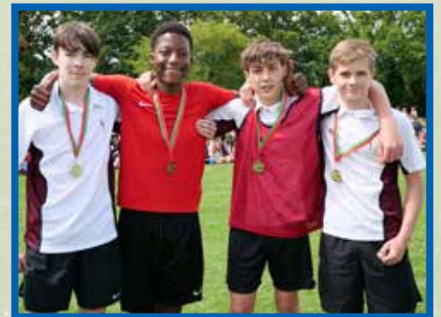
Year 9 Relay - Gold Medallists