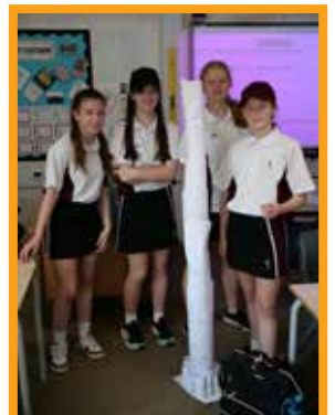
Maths set the challenge of building the tallest free standing tower out of 30 sheets of A4 paper and Sellotape.