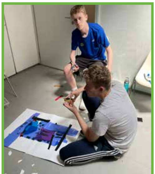
Year 10 students went to the Sainsbury's Arts Centre.