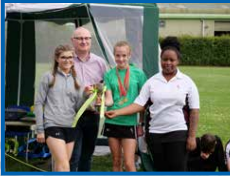
The House Cup for Year 8 was won by CLE and RGD (DANE)