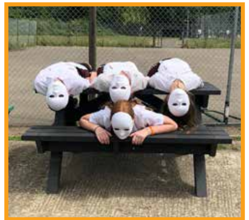
In Drama students visited Pizza Town, an immersive Italian restaurant where students sat down to dine but ended up involved in a murder mystery. Students were given character prompt cards in order to crack the case and report their findings to the police officer.