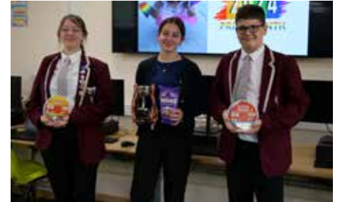
Celebrating LGBT+ Pride month is an essential event within our school community at Birchwood.

The origins of Pride Month date back to a series of protests in 1969 and is a response to a violent police raid at the Stonewall gay club in New York City. The protests were widely considered a significant moment in promoting the rights and equality of LGBT+ people.