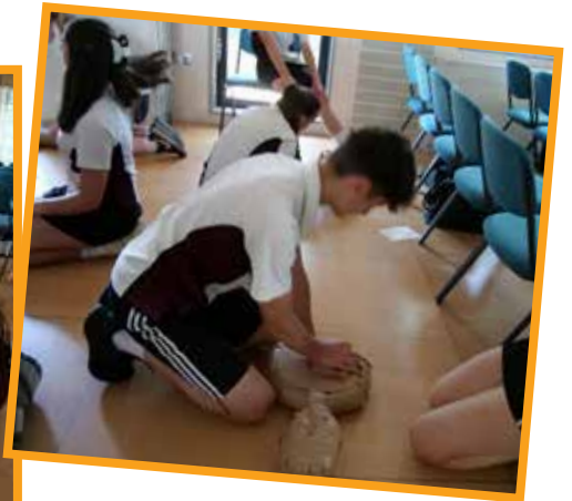
First Aid training.