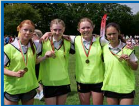
Year 9 Relay - Gold Medallists